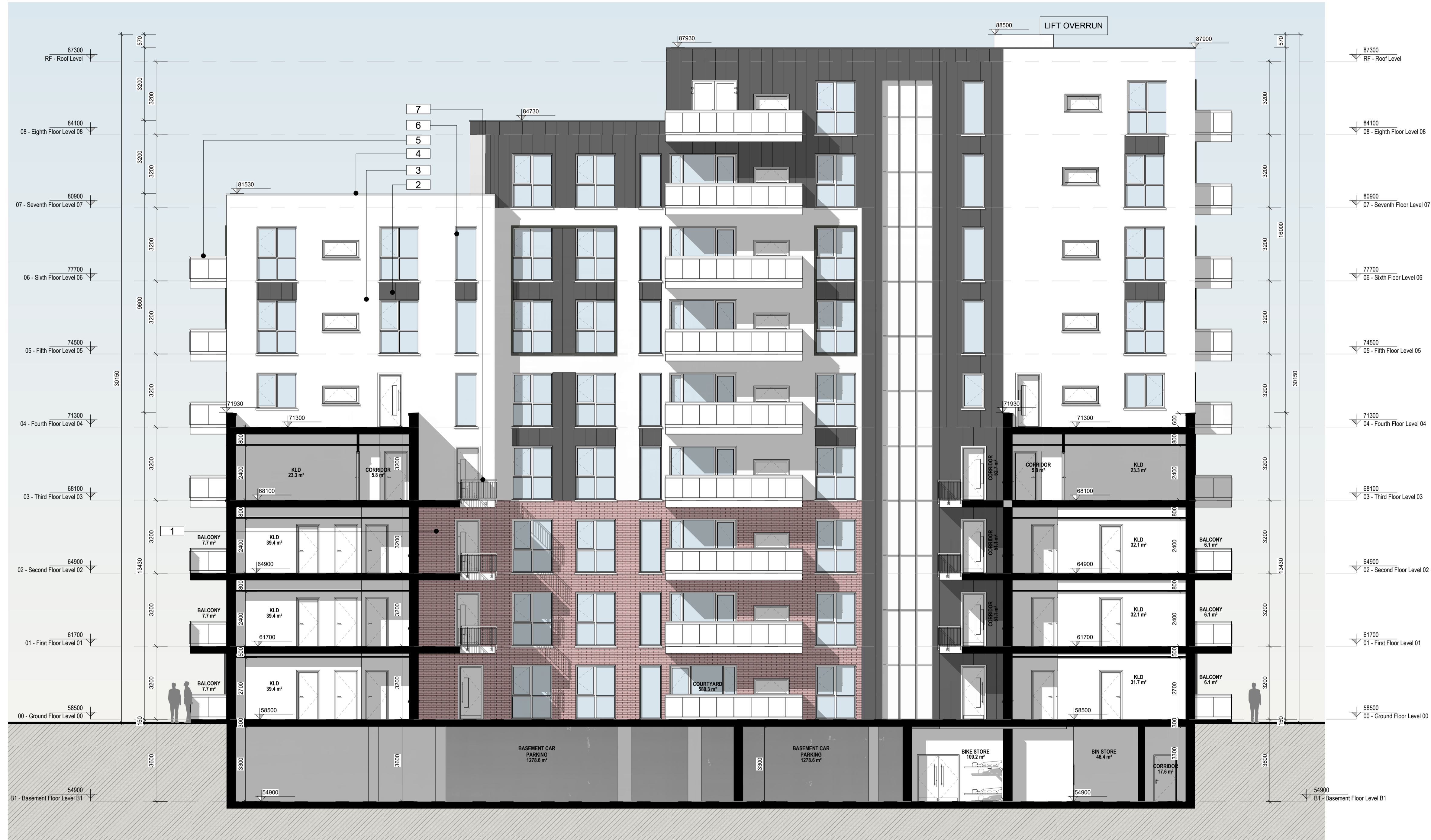
1 Courtyard West Elevation 1 : 100

Floor Plan Key ES - En suite ST - Storage KLD - Kitchen/Living/Dining AOV - Automatic Opening Vent HP - Hot Press